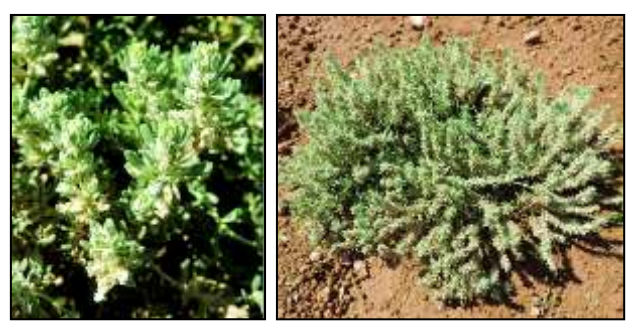
Figure.5 Teucrium polium L.

Teucrium polium L. has 8-15 cm length and 10-40 cm diameter. Moreover, it was lying on the soil or standing, white or gray color and hairy structure. The leaves are 0.15 \times 0.75 cm and rectangular, the flowers are 0.4 \times 0.75 cm and whitish (Figure.5) Virgo flowers are 5-12 cm long. The structure of leaves and body are more effective in the visual characteristic of the plant comparing to its flower. The vegetation duration is 6 months (March-August) and the flowering period is 4 months (April-July).