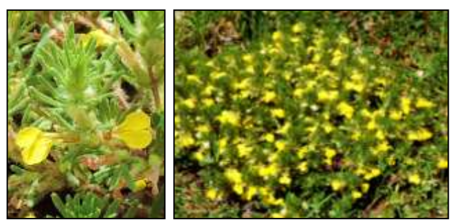
Figure.2 Ajuga chamaepitys subsp. chia var. chia

Ajuga chamaepitys subsp. chia var. chia has 7-15 cm diameter, 4-15 cm height and has a creeping structure (Figure.2). Leaves are 0,4x1,9 cm wedge shaped. Flowers were 0,7x1,2 cm yellow color and were separated from their tip parts. Virgo flowers were 5-15 cm long. It was seen that the vegetation period is 5 months (March-July) and the flowering period is 4 months (April-July).