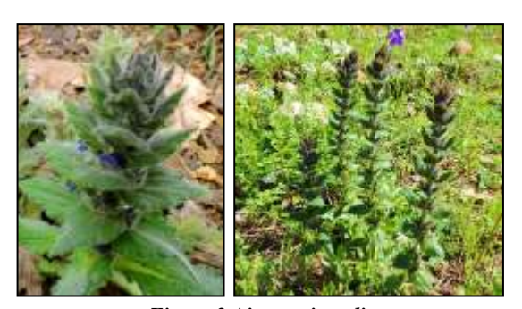
Figure.3 Ajuga orientalis

Ajuga orientalis is a plant with 18-30 cm length, 8-15 cm diameter. The leaves are 3x3.5 cm and are arranged crosswise on the body. Flowerpots are 0,4x1,1 cm violet-blue and cream colored (Figure.3). Virgo flowers were 18-30 cm long. The vegetation period is 2 months (March-April) and the flowering period is 1 month (15 March-15 April).